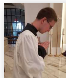
Bow of the Head

When carrying an item, only a small bow of the head is done, never a full bow.